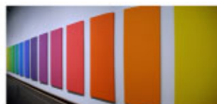
INOX CX Series