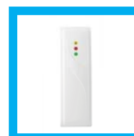
Wireless Vibration Detector