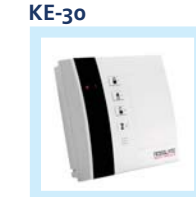
KE-30 – Battery Operated 2-Way Wireless Keypad

HomeLogiX™'s wireless communication supports a built-in keypad, internal and external sound system, and a two-line backlit LCD, that in addition to 40 zones (39 wireless and one hardwired), four remote keypads, four wireless repeaters, four wireless sirens, and eight remote controls, as well as 2-way RF products complete the solution for maximum peripheral security.