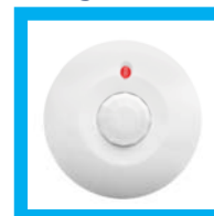
Advanced Wireless Ceiling PIR Motion Detector