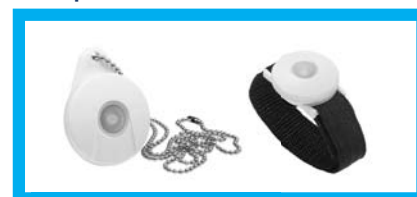
Wireless Waterproof Emergency Button