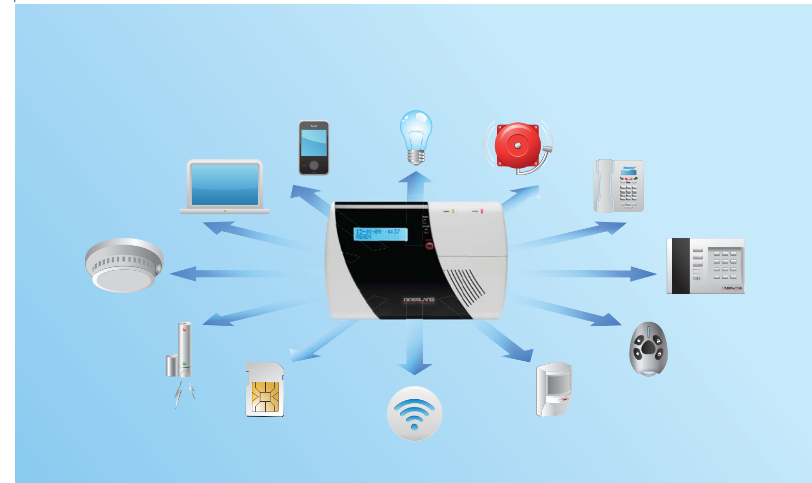
Complete HomeLogiX solutions

Offering the latest in security technology, the HomeLogiX™ family of advanced burglar and fire alarm wireless solution, have all the benefits of advanced wireless technology, enclosed in a compact, aesthetic, easy-to-use control panel. All compatible accessories such as keypads, detectors, sensors and other peripherals are conveniently installed around your home or office, with the flexibility to add, remove, or change their location as desired.