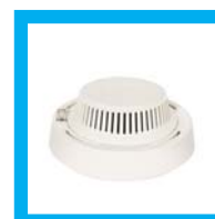
Wireless Optical Smoke Detector