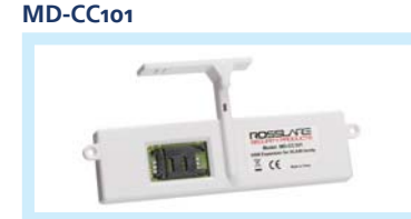
MD-CC101 – GSM Stick – GSM Communicator module for HomeLogiX panels

Furthermore, HomeLogiX™'s wireless communication option ensures that if the phone line is cut, the system is not compromised eliminating a would-be intruder's ability to disable communication by cutting the home's phone or cable lines. Anti-masking capabilities of our PIR sensors and advanced Tamper prevention complete the solution against compromising of the system.