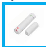
Compact Cylindrical Wireless Magnetic Contact and Shock Sensor