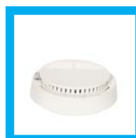
Wireless Ionization Smoke Detector