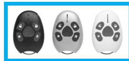
Wireless Keyfob with Emergency Button