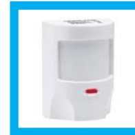
Wireless Pet Immune Passive Infra-Red Detector