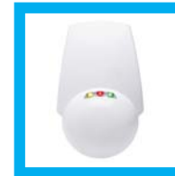
Advanced Wireless Spherical Lens PIR Detector